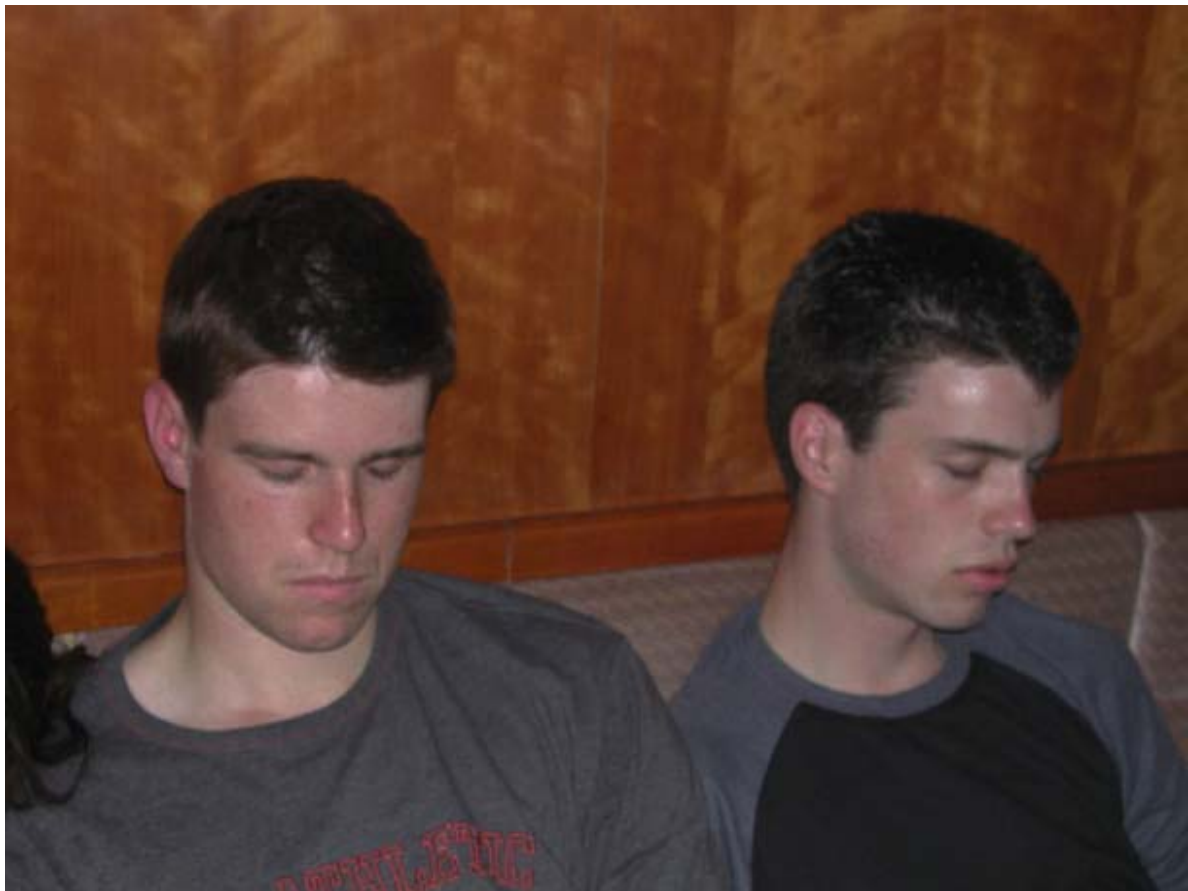
Spot the Difference